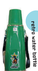
retro water bottle