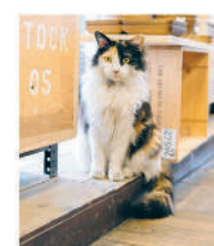
Kanon, the store cat