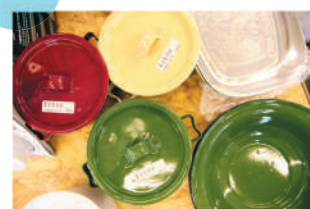
small stew pots