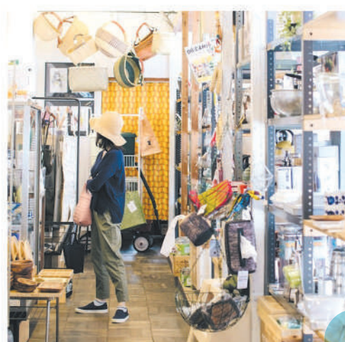
inside the store