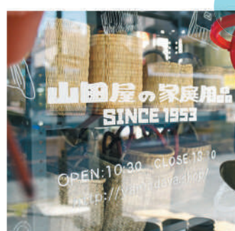
山田屋の家庭用品 SINCE 1953