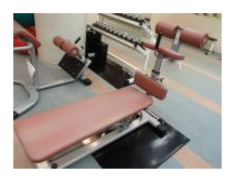
Abdominal muscle stand