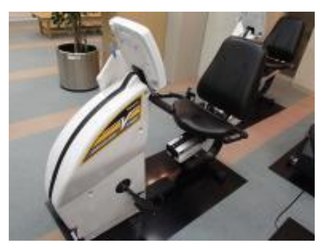
Recumbent exercise bike