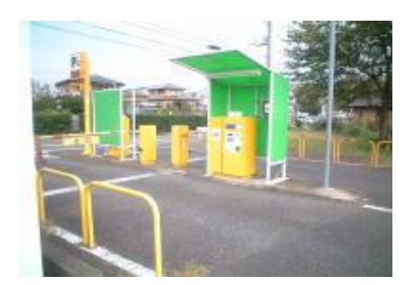
Carpark no. 1