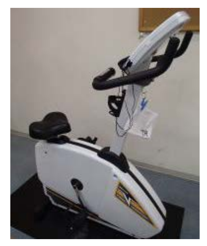
Upright exercise bike