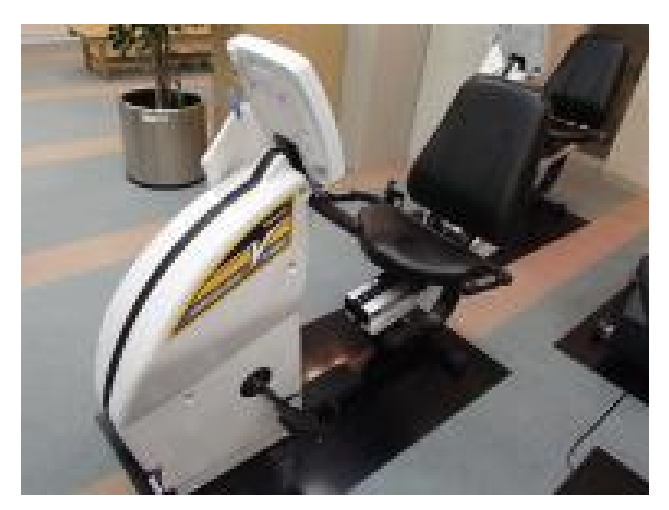
Recumbent exercise bike