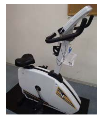
Upright exercise bike